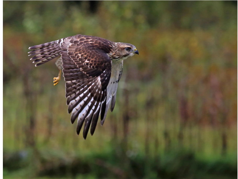
Broad-Winged Hawk

According to a survey taken in 2016 by HMANA in Voorheesville, NY of 216 individual assorted Hawks and Raptors in Upstate NY the most common species of Hawk in our region is the Broad-Winged Hawk.